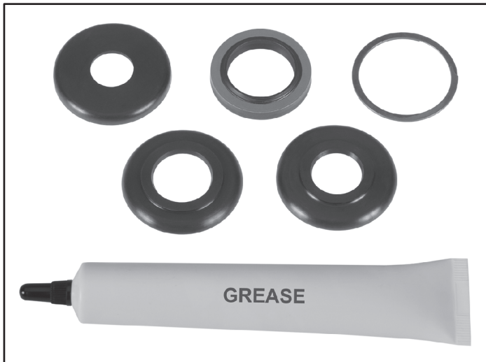
371-110A TAS Input Shaft Seal Kit - Major

In stock at Harrisburg and Lewisville warehouses and ready to be added to your next regular stock order.